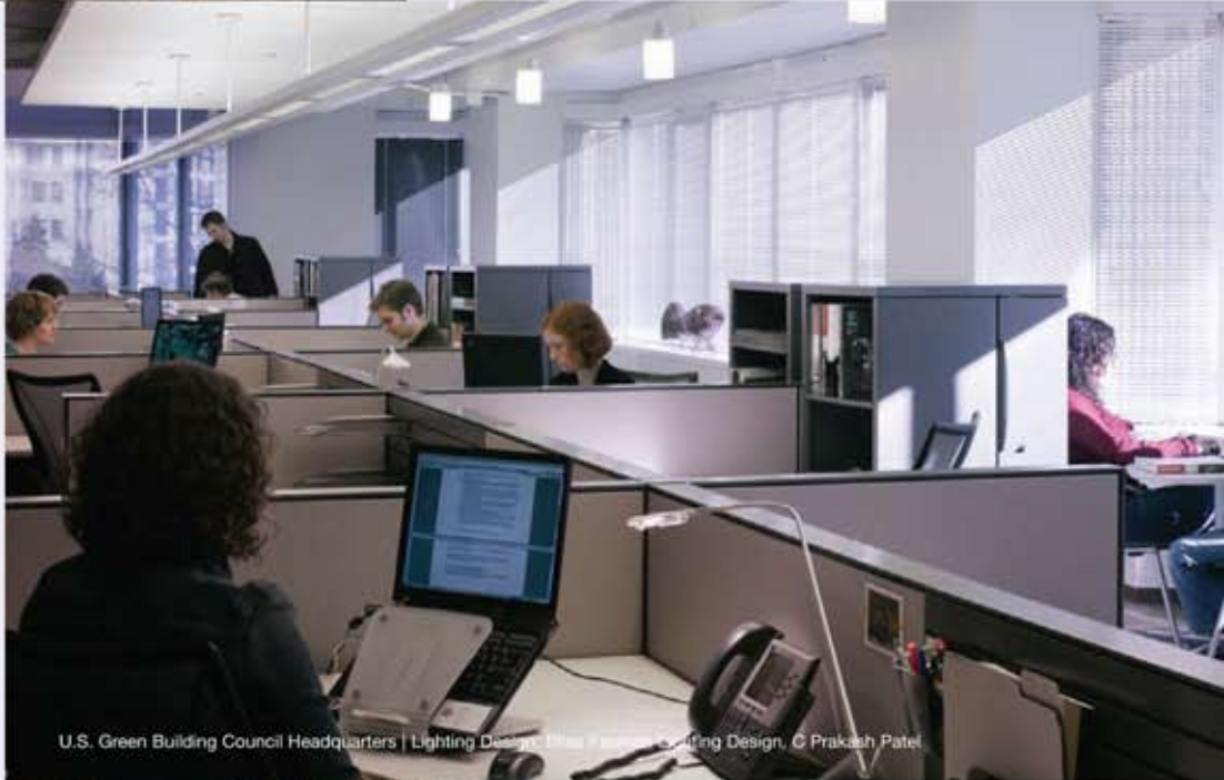
U.S. Green Building Council Headquarters | Lighting Design: Elias F. Garcia Lighting Design