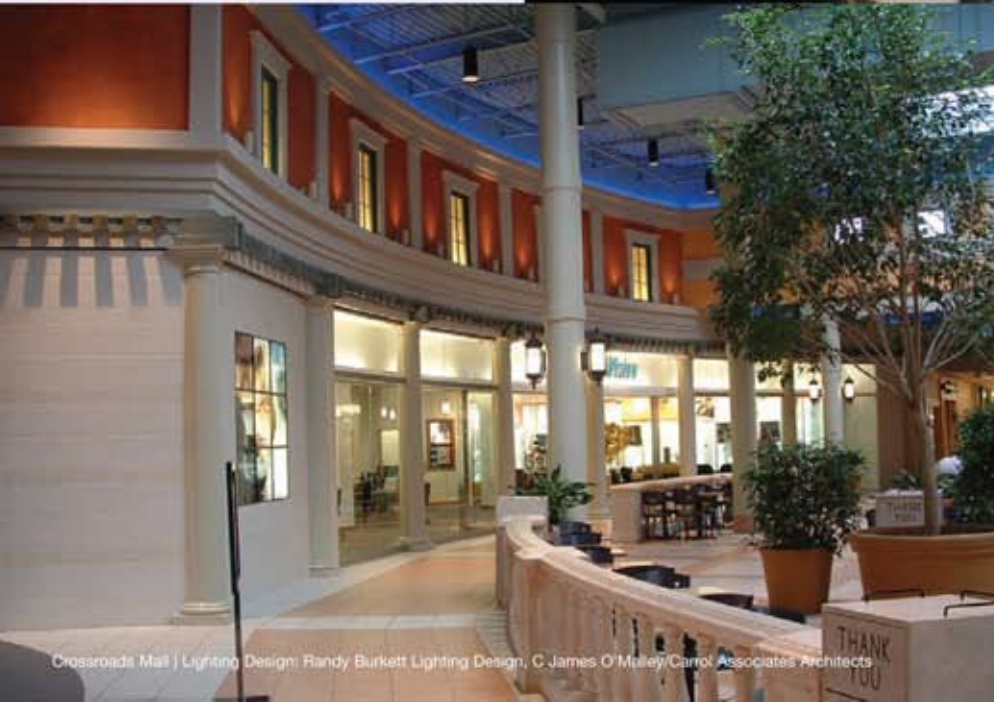
Crossroads Mall | Lighting Design: Randy Burkett Lighting Design