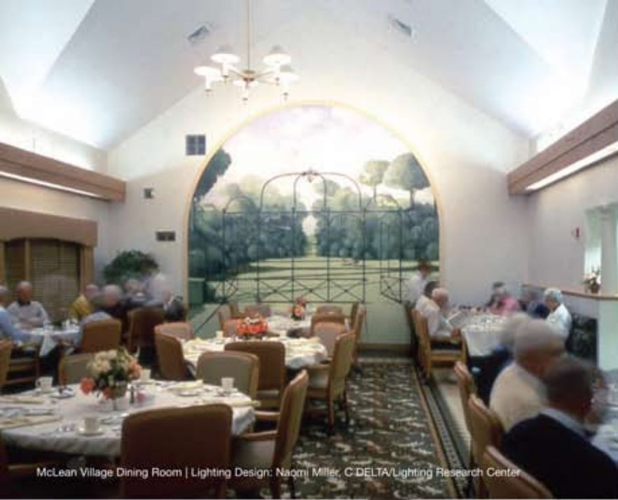
McLean Village Dining Room | Lighting Design: Naomi Miller, C-DELTA/Lighting Research Center