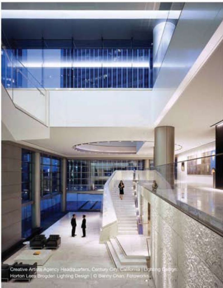
Creative Artists Agency Headquarters, Century City, California | Lighting Design: Horton Lees Brogden Lighting Design | © Benny Chan, Fotoworks

Poor lighting may negatively impact health and well being by producing glare, eyestrain, flicker, tension and interference with the body’s circadian rhythms. It can also produce unsafe conditions by failing to properly illuminate hazards such as curbs, stair edges—even labels on cleaning products. Energy policies should promote lighting that in turn promotes safety, security and well being.